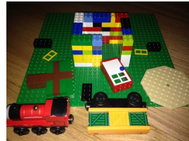
EF-3 Wind Speed: 136-165

Roof torn off, door and windows scattered, trees uprooted