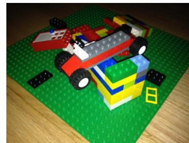
EF-5 Wind Speed: 200+

Cars moved hundreds of yards, buildings leveled