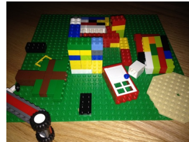
EF-4 Wind Speed: 166-200

Train cars tipped over, roof torn off, door and windows scattered, trees uprooted