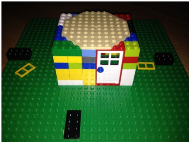
EF-1 Wind Speed: 86-110