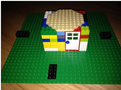
EF-0 Wind Speed: 65-85

Developed by scientist T. Theodore Fujita to measure tornadoes